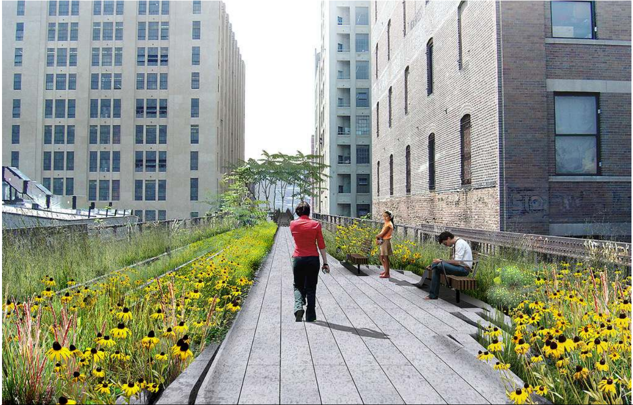
Rendering of a proposed wildflower field.

project to describe the way that agriculture and pedestrian can interact. Diller, Scofidio and Renfro define AGRI-TECTURE as “A flexible, responsive system of material organization where diverse ecologies may grow.” 41