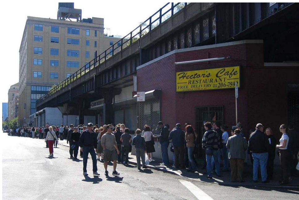
Image of the line of people waiting to access the High Line in the summer of 2009.

High Line is located directly in the middle of one of Manhattans most trendy areas, and therefore one of Manhattans most quickly evolving. As of