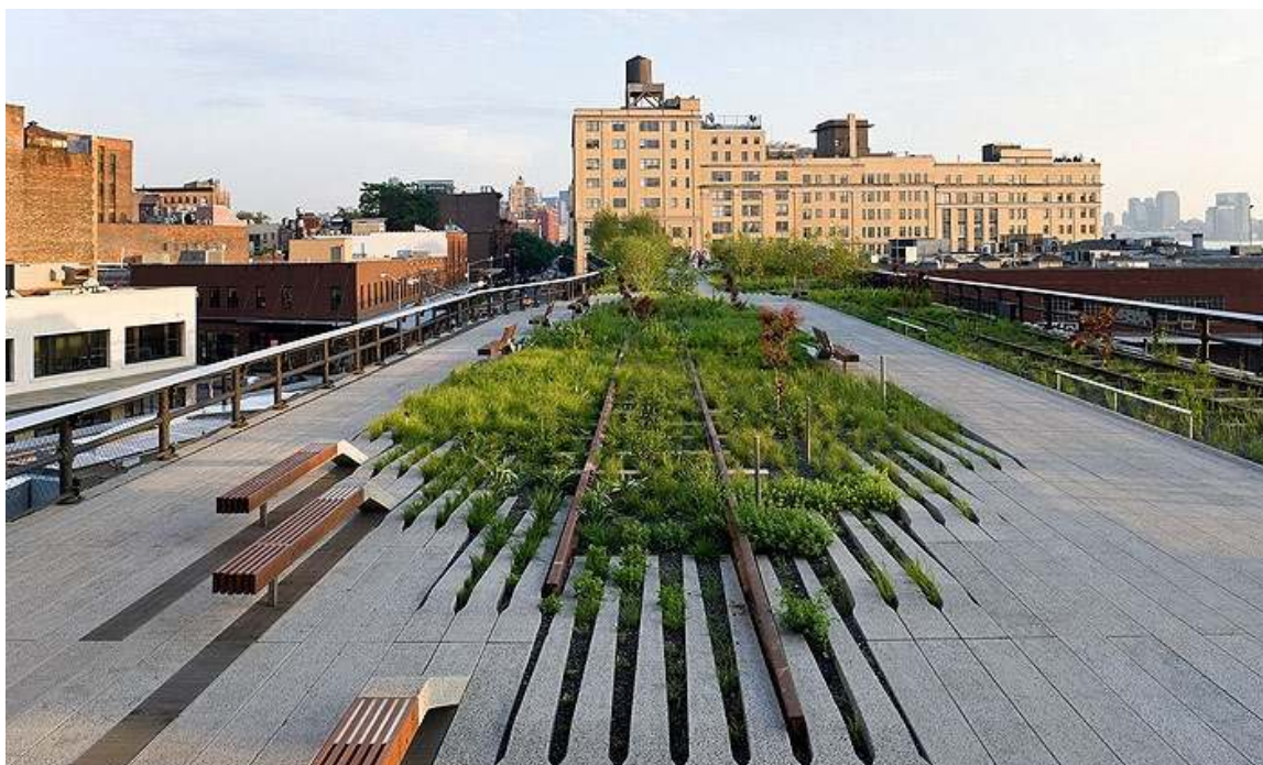
Image of completed High Line.