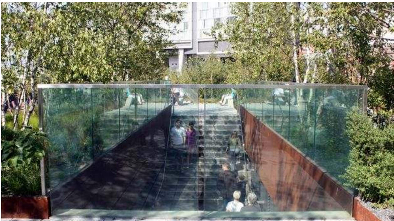
Image of completed High Line. Available < http-www.travelogged.com_a_6a010536af5f79970b0120a5bd387f970b-600wi >