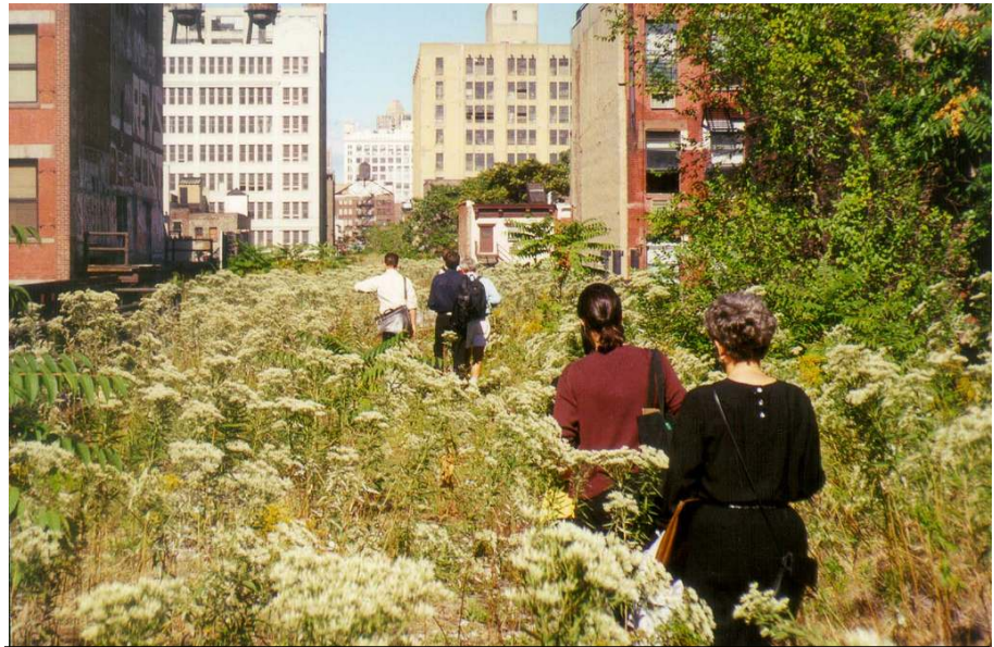
Image of High Line pre-construction.

Though it stopped being used in 1980, the highline remained undisturbed for almost 20 years before it became the subject of controversy among residents in the neighborhoods