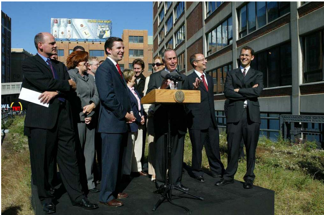
Image of 2004 press conference with Mayor Bloomberg.

fate of the High Line through the Surface Transportation Board. 25 The State controlled the largest considered developable below the High Line, and the City's support was necessary for effective and efficient public funding. 26 Though it was determined that funds could be gathered over time, and the project could be phased, the Friends of the High Line understood that the support of the varying levels of government were crucial to the success of the project and they tried to create specific allies within the government to aid their cause. The New York Times, on their reporting of the Project's opening in June of 2009, stated "With all the bureaucratic hurdles the project had to overcome, it was perhaps no wonder that so many representatives of different arms of government were there for Monday's celebratory news conference, including Amanda M Burden, the city planning commissioner; Adrian Benepe, the parks commissioner; and Representative Jerrold Nadler, Democrat of New York." 27