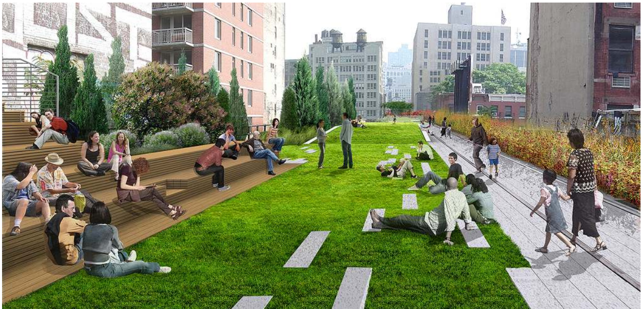
Rendering of Phase 2 of the High Line, currently in construction.

“Perhaps most important, the design confirms that even in a real estate climate dominated by big development teams and celebrity architects, thoughtful, creative planning ideas -- initiated at the grass-roots level -- can lead to startlingly original results.” 46