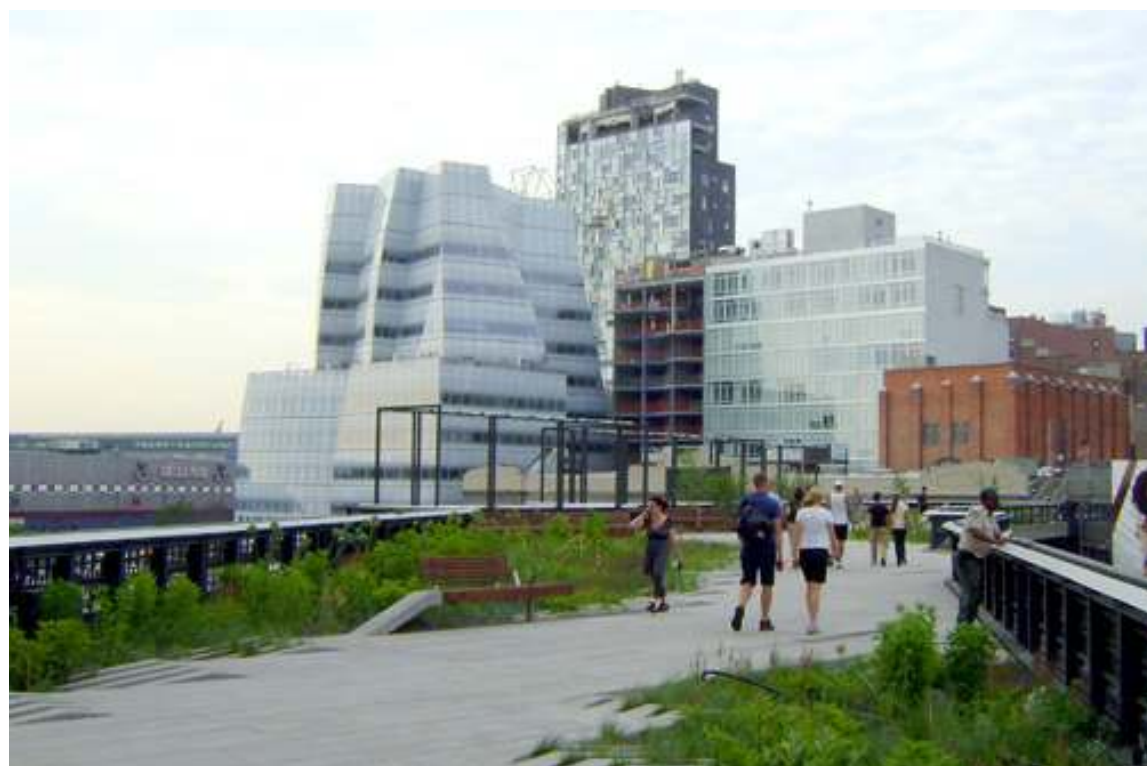
Image of completed High Line. Available http://www.jaunted.com/files/6193_HighLine3.jpg