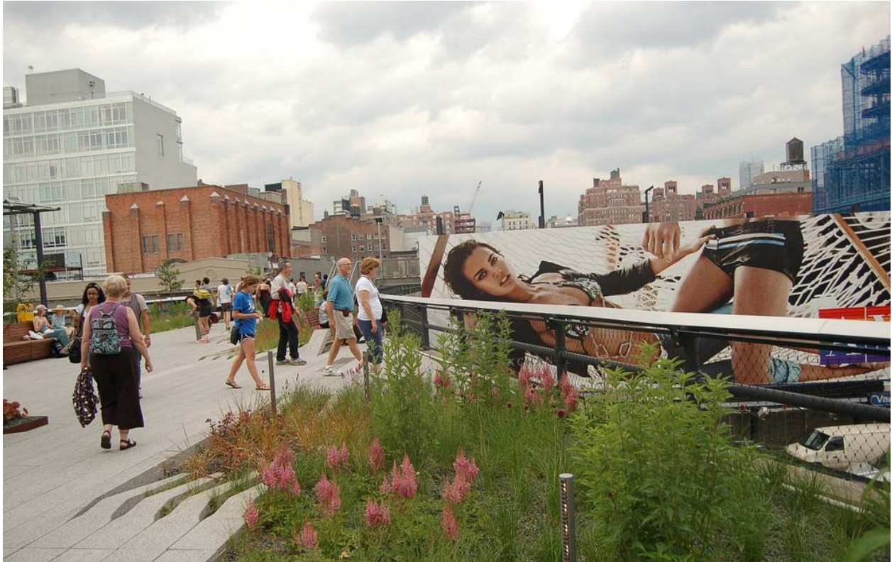
Image of completed High Line. Available < http-farm4.static.flickr.com_3439_3943569014_aeb1f5d83d_b.jpg >