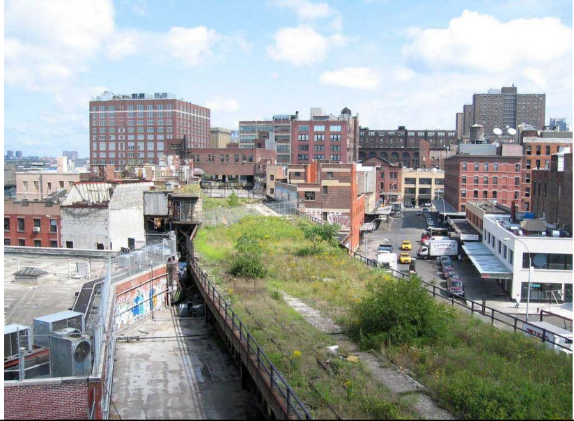
Image of High Line pre-construction.

Built in the 1930's, the High Line in the lower Manhattan area of New York City served as an urban rail line to deliver and receive products from the Meat Packing District. Over the course of the century, the area that the line moved through