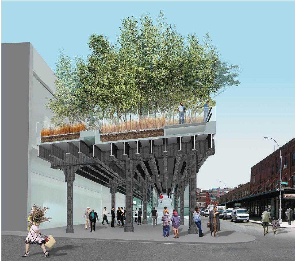
Rendering at Gansevoort Street.

As Diller, Scofidio and Renfro describe in a recently published book of their work, the project team used “ agri-ecture that combines organic and building materials into a vegetal/mineral blend, the park accommodates the wild, the cultivated, the intimate, and the social.” 40 The final design uses a discreet unit of paving that bends to create curbs and seating and taper to create smooth transitioning between surfaces. AGRI-TECTURE, a term coined for the High Line