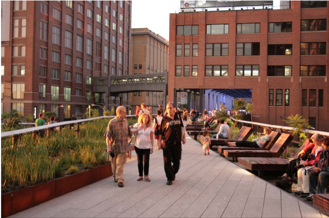
Image of completed High Line. Available < http://culturefix.files.wordpress.com/2009_07_highline-chairs >