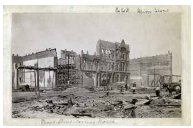
Photograph taken after the 1889 fire in Seattle

catastrophic fire in 1889 burned down 65 acres of Seattle's downtown for lack of water to put it out. Citizens had had enough and they made the decision to invest in re-building the infrastructure required to secure a safe, healthy and abundant supply of clean water.