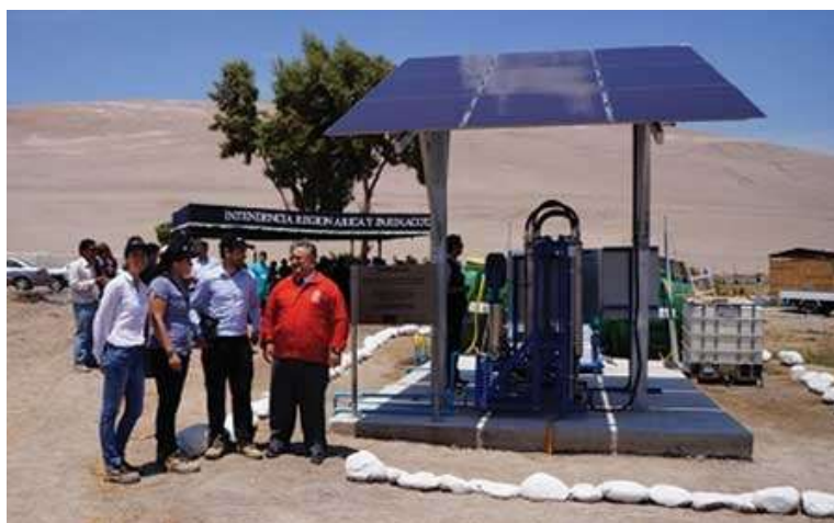
The US$210,000 plant will be monitored over the coming months

However, to ensure that these concepts are 'induced adequately' in the market, Sommariva also argues that the first attempts at commercialisation need to be made within an 'initially restricted market' where renewable desalination projects of this type 'can compete in a restricted arena without being forced to compete with the large IWP-IWPP projects involving traditional technologies.'