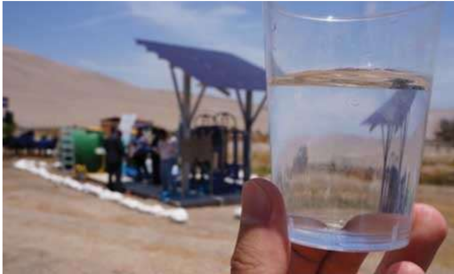
Transparent technology: the Lluta Valley project uses membrane separation technology to remove salt from the water, all powered by solar photovoltaic panels

feedback before they will be able to compete with state of the art technology “in terms of robustness, reliability and maintainability”.