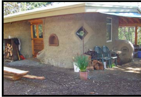
Cob Woodworking Shop